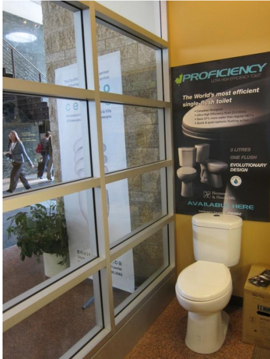
Canadian designed ultra low flow toilets demonstrated at Ottawa's City Hall!

110 Laurier Ave West, Ottawa K1P 1J1 info@envirocentre.ca 613-580-2582